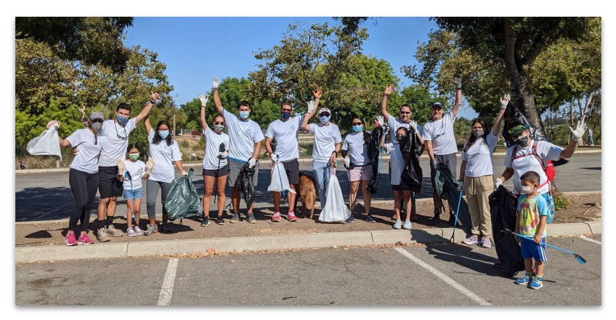
Our first Local Service Opportunity was a success!