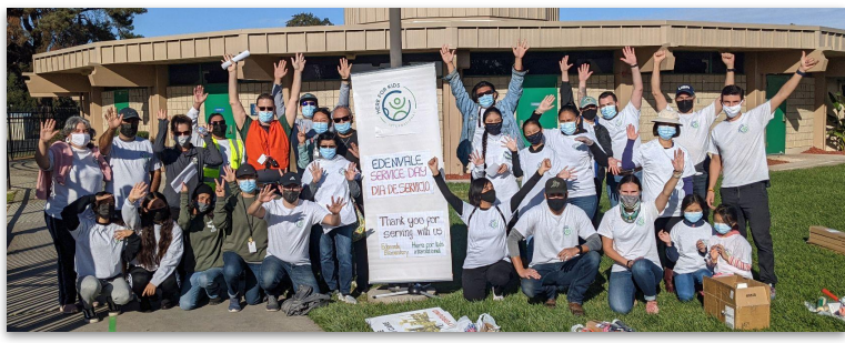
Edenvale Service Day main leaders

• HFK's logo is embraced by our alumni during Halloween.