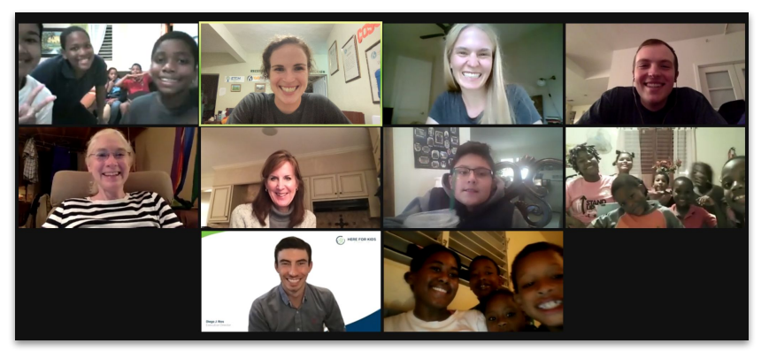
"Vanderbilt University" VSE