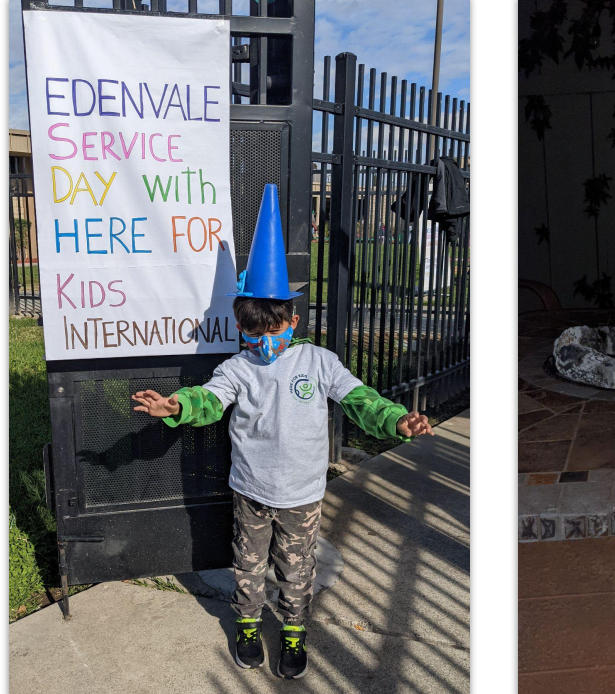
Successful day of service!