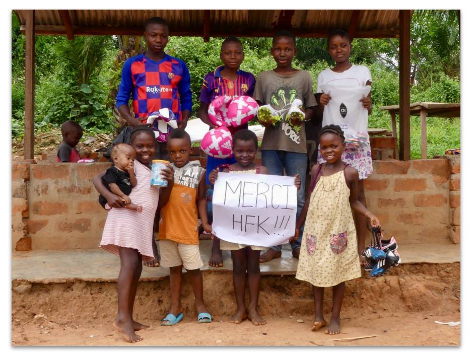
"Thank you" from The Lobiko Initiative in Congo!