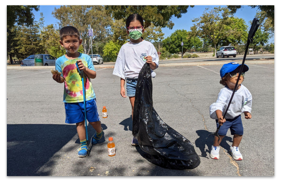
Some kids were serving their community for the first time!