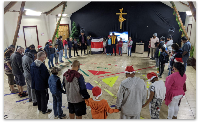
Praying together after watching a soccer game!