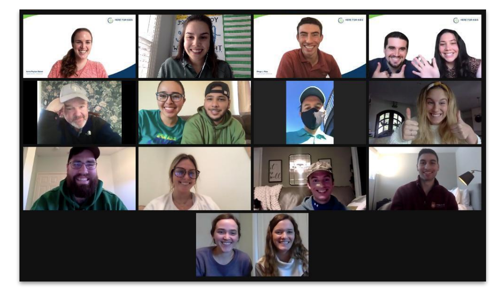
Virtual Service Experience Leader Training

Virtual Service Experience (VSE) Leader Training takes place to prepare leaders for VSE's in the Spring as we temporarily replace International Service Trips.