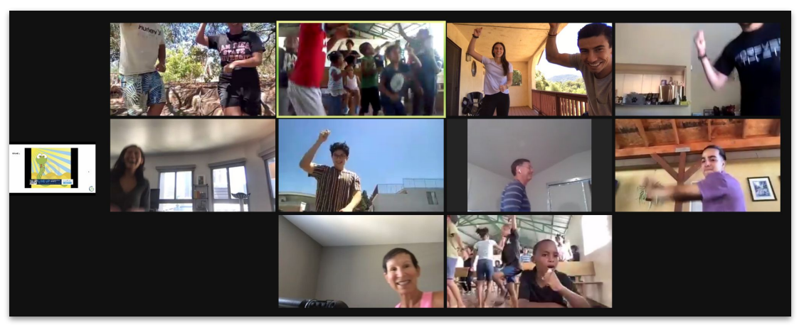
"Last Chance" VSE involved lots of moving around!