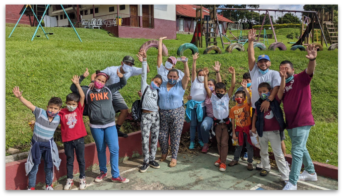
Waving goodbye after a week with the kids