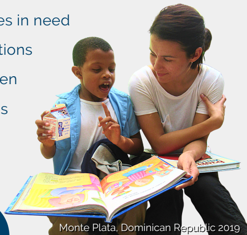
Monte Plata, Dominican Republic 2019