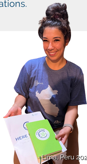
Lima, Peru 2022