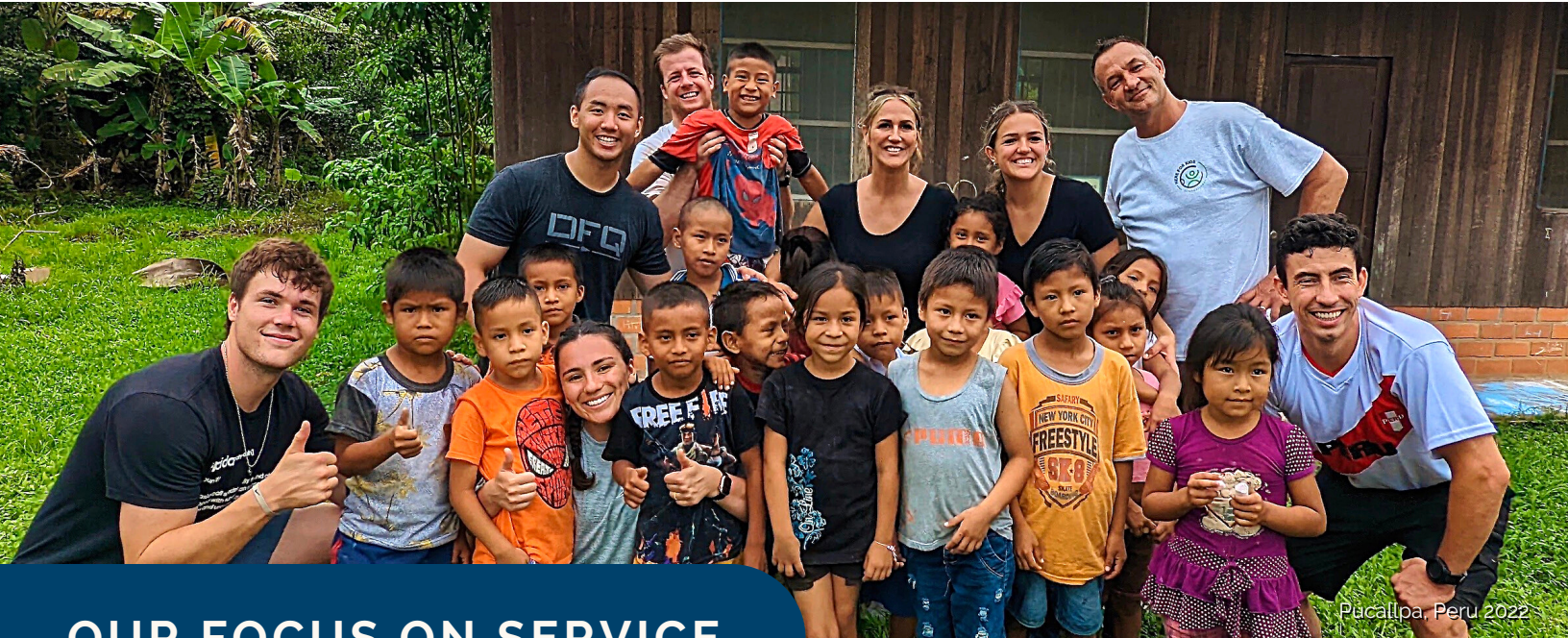
Pacallpa, Peru 2022

We're a non-profit that serves children worldwide while transforming lives by teaching the eternal joy of service.